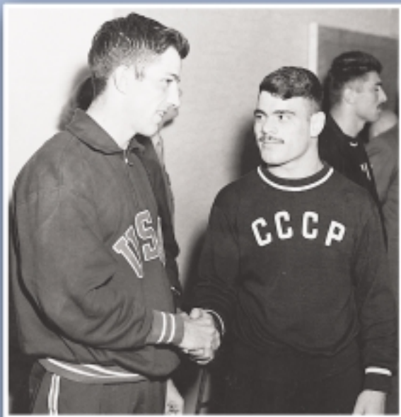
Henson with Russian at Olympic Games