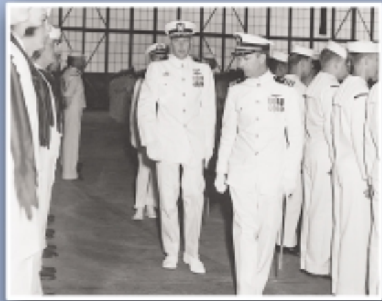
Henson reviewing Naval Squad