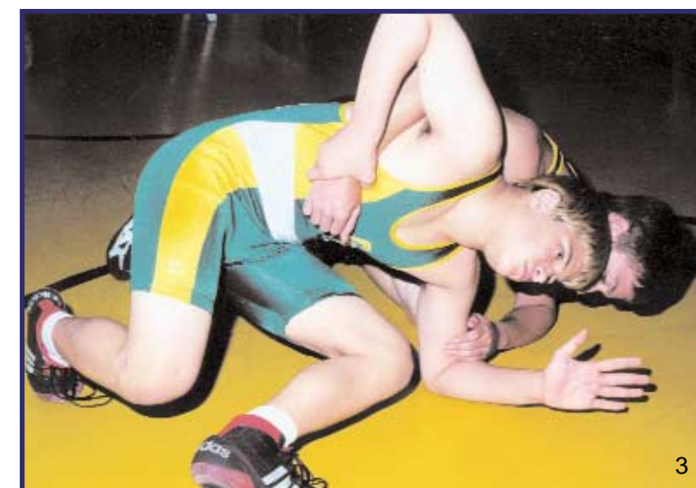
3-The offensive man has stepped his left foot in and has rotated to his left toe. He is beginning to shrug his head over his left elbow.