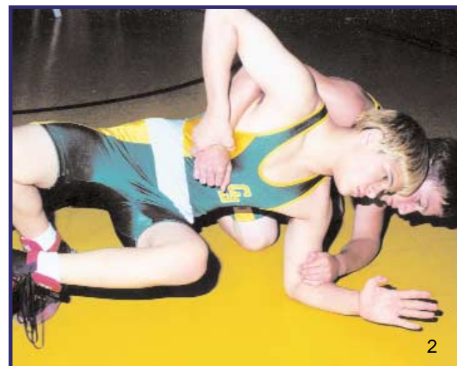
2-The offensive man has stepped his right foot in a 1/2 foot, lifted his butt off the mat and dropped to his left elbow.