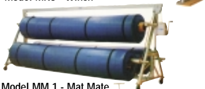
Model MM 1 - Mat Mate