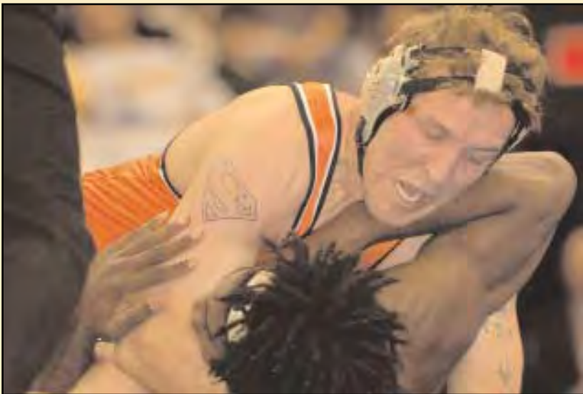
NCAA Division I 197 lbs. Championship Finals - Jacob Rosholt, (Oklahoma St.) dec. Phil Davis, (Penn State), 10-3.